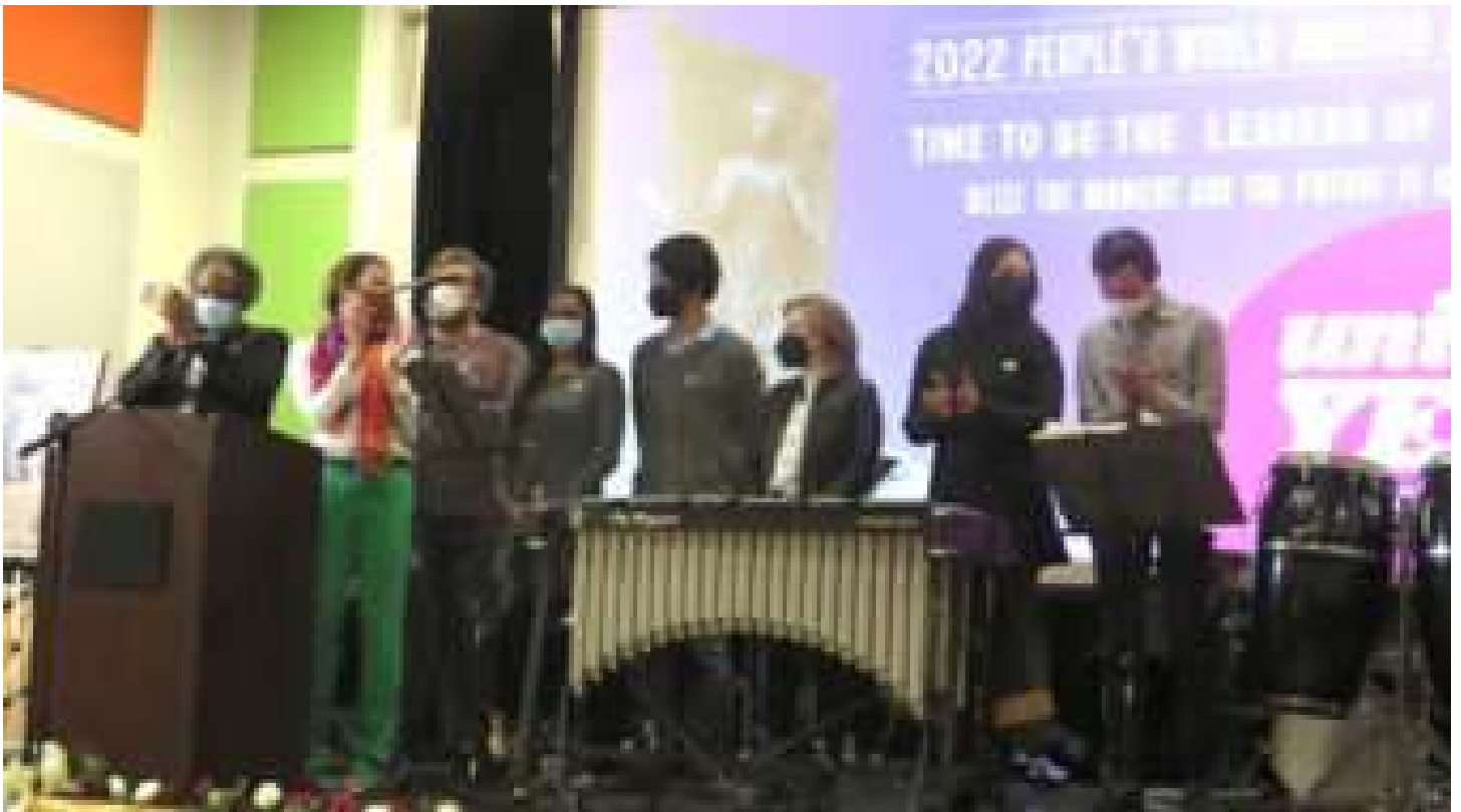
Yale graduate teachers and researchers vote to unionize