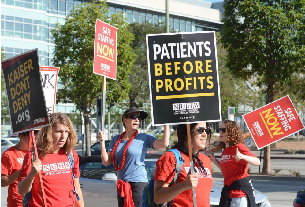
Kaiser workers strike at the Oakland Medical Center to protest the HMO's "unethical" working conditions on Aug. 16, 2022.