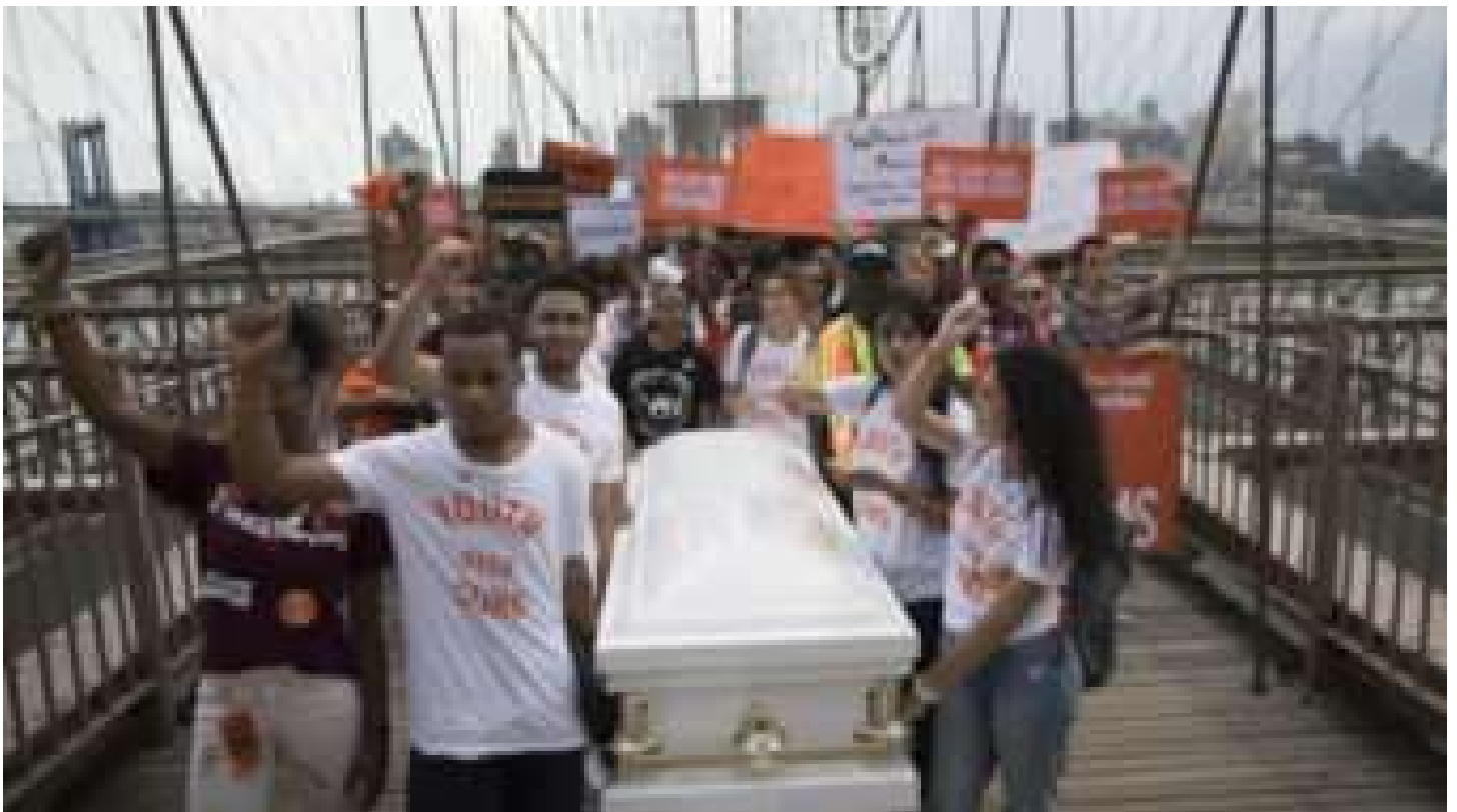
Warning: U.S. capitalism is lethal (and bad for your health)